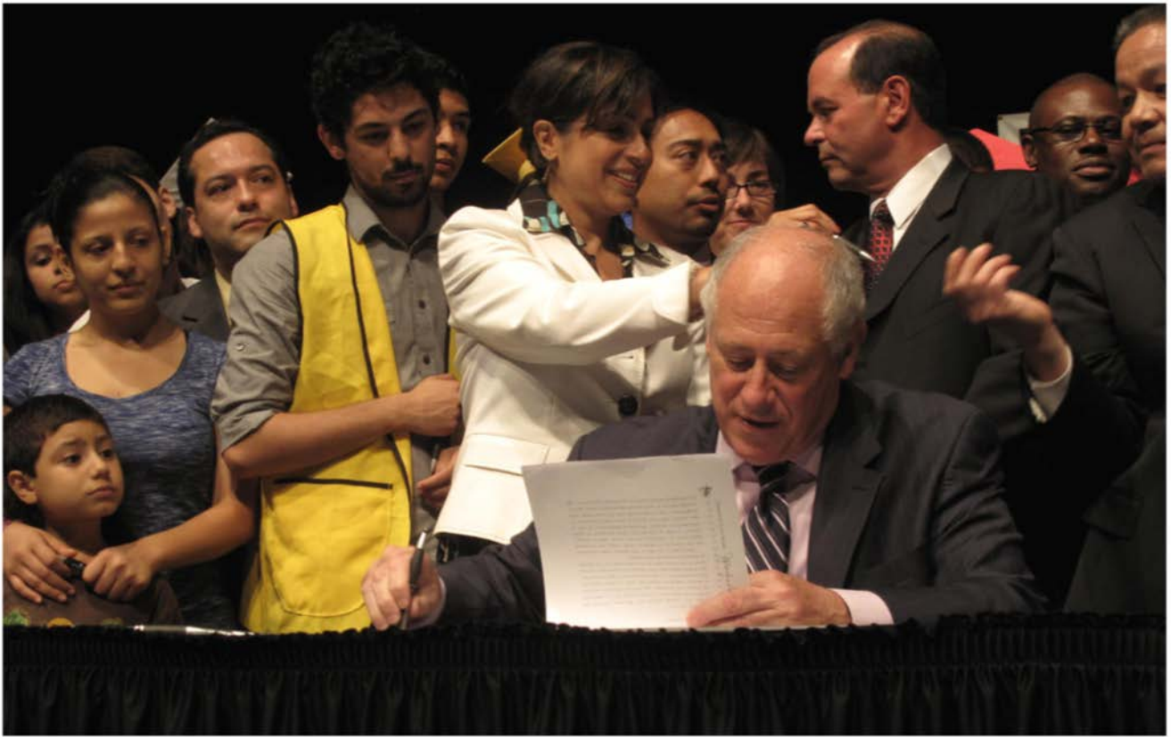
Governor Pat Quinn signs the Illinois DREAM Act into law on August 1, 2011, at Chicago's Benito Juarez High School.