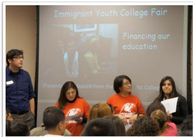
Immigrant Youth College Fair in Cicero in 2010 hosted by the Immigrant Youth Justice League and Nuestra Voz.