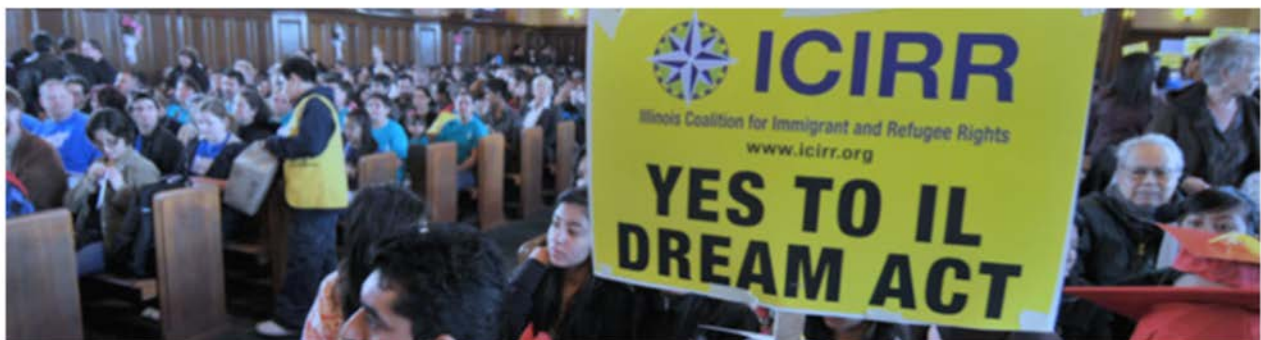
At a Chicago New Americans Rally on April 30, 2011 in support of the Illinois DREAM Act.

www.collegeillinois.org ISAC.529info@isac.illinois.gov 529 Prepaid Tuition Program PO Box 19291 Springfield, IL 62794