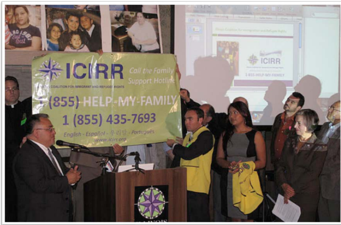
Celebrating the launch of ICIRR's volunteer run Family Support Hotline.

Contact a community organization near you if a student you know runs into any difficulties regarding his or her immigration status while trying to access higher education in the United States. Some of the difficulties he or she may encounter include