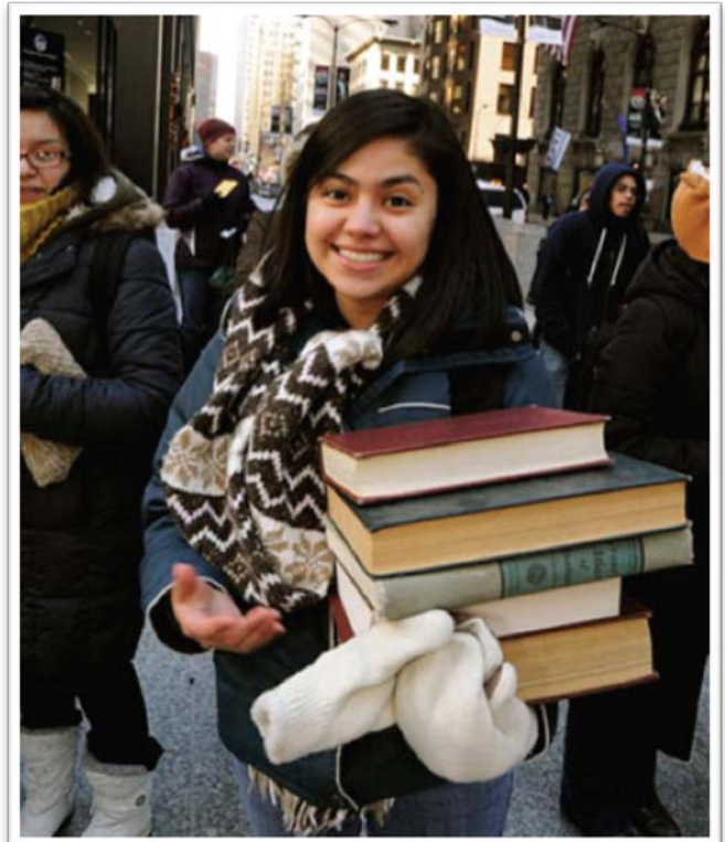
At an Immigrant Youth Justice League rally in Chicago in 2010. Contact an organization near you and get involved!

Contact an organization near you to find out how you can join advocacy efforts in Illinois to help undocumented students achieve their educational goals, support their families, and give back to society. (See Appendix C)